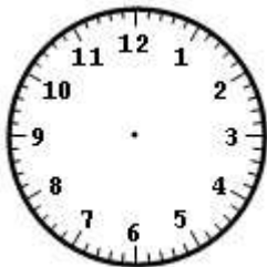
seven minutes to nine